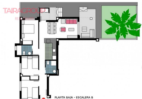
PLANTA BAJA - ESCALERA B