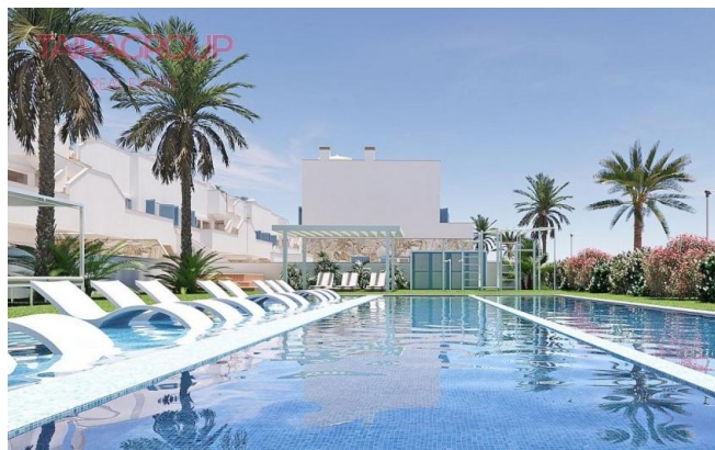
TAIRAGROUP REAL EASATE